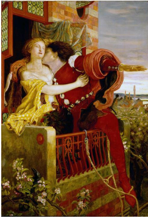
Romeo and Juliet